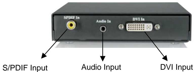
Front View Layout